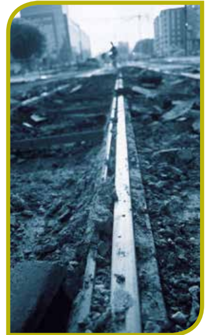
@ Lennart Nacke

"When considering the PPP option, the government has to compare the cost of public investment and government provision of services with the cost of services provided by a PPP." 119