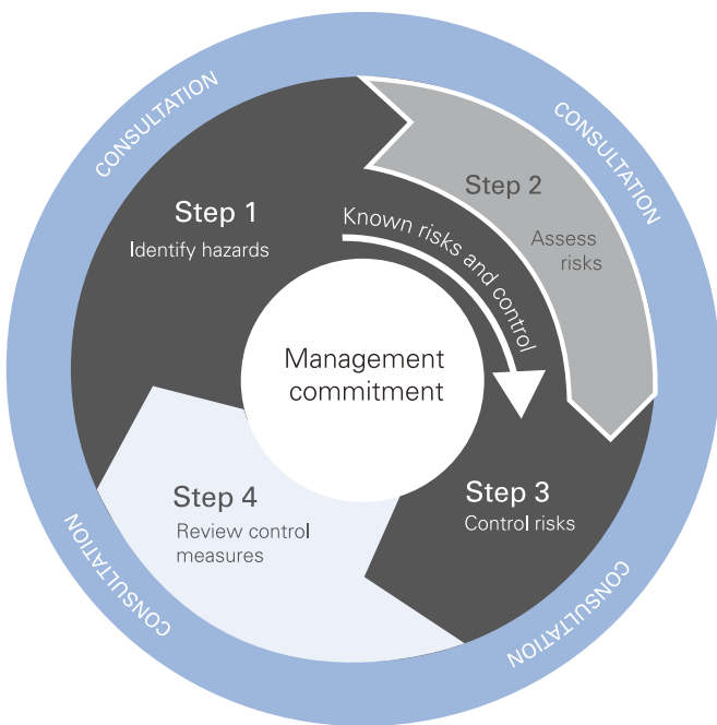
Figure 1: The risk management process

A PCBU must eliminate psychosocial hazards and manage risks to health and safety arising from work so far as is reasonably practicable. As is required for any other hazard, the systematic four-step process described in the NSW code of practice How to manage work health and safety risks should be applied to address psychosocial hazards. The four steps are noted in the diagram below.