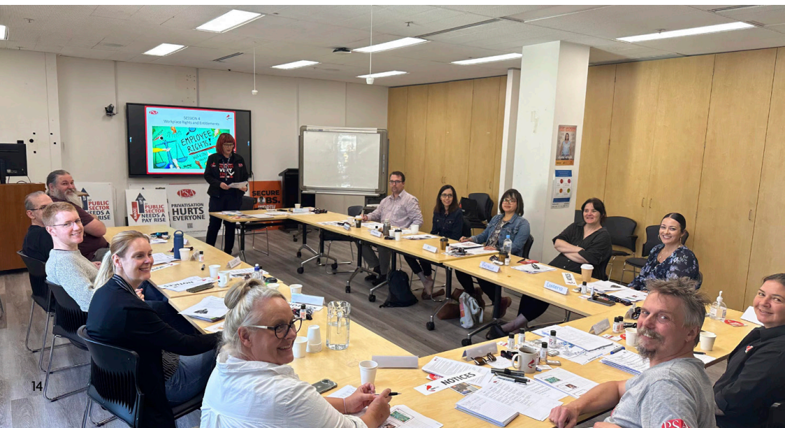
HERC members meeting at the CPSU NSW head office

Central Council is the union's chief governing body. It consists of the Executive plus 39 delegates elected from across the union's diverse membership. It holds eight meetings per year.